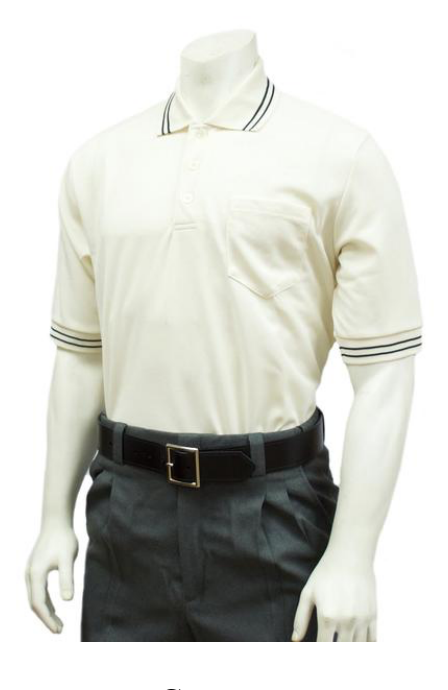
Cream with 2 thin black stripes