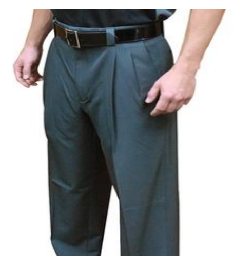
Smitty 4-way Stretch, Performance Poly Spandex Charcoal Grey

Plate BBS392 / BBS396 (expander waistband) Base BBS390 / BBS394 (expander waistband)