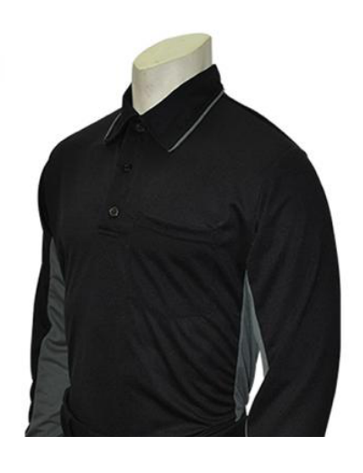
MLB Black with gray side panels