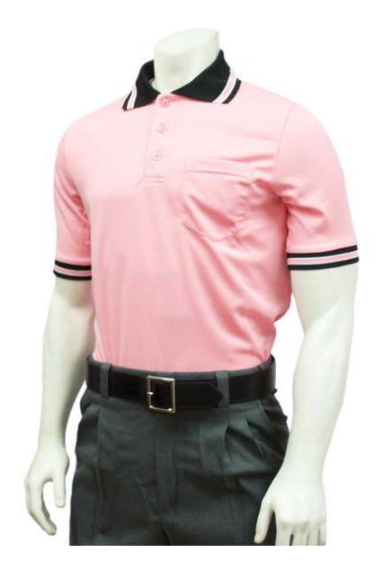
Pink with black trim and collar to be worn in connection with Women's health initiatives