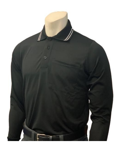
Black with 2 thin white stripes

Long sleeve shirts may be worn by the plate and base umpire in cool weather