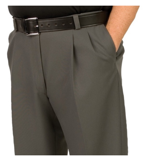
Gerry Davis Charcoal Umpire Pants