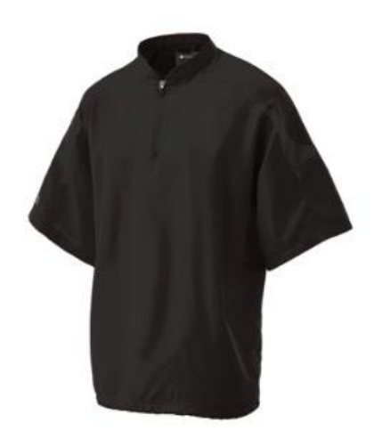
Black, half-zip, short-sleeve pullover jacket – light weight.

Black jacket with 2 white shoulder stripes. Either medium weight half-zip, or heavyweight fleece full-zip or half-zip. Both the plate umpire and the base umpire may wear a jacket if it is cold.