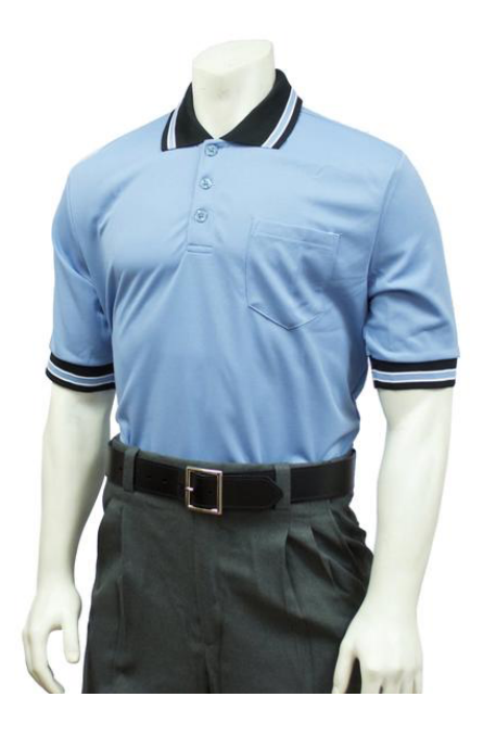
Sky Blue (also known as polo blue, or delta blue) with black trim and collar

May only be worn if both umpires have the exact same color and style