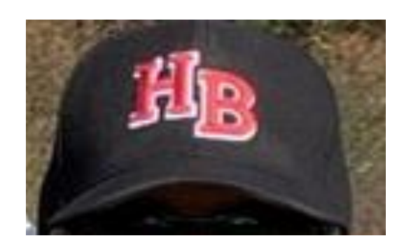
Fitted black umpire hat with red HB is the only hat to be worn for every HB game