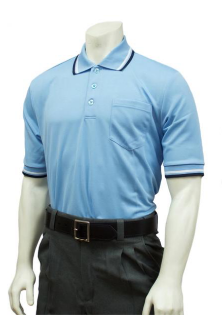
Powder Blue with navy and white trim