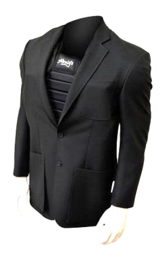
Black umpire plate coat