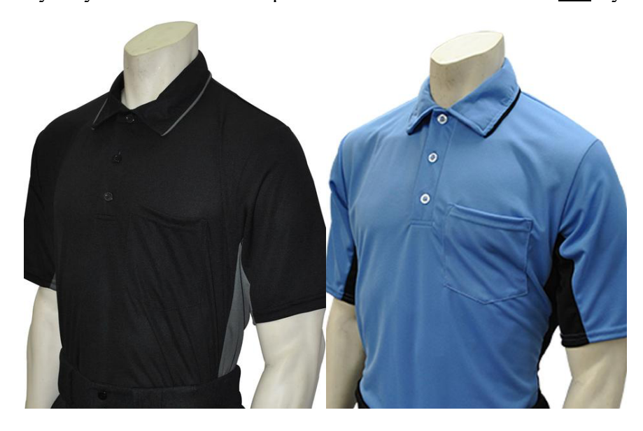
MLB Black with gray side panels

May only be worn if both umpires have the exact same color and style