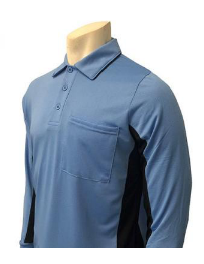
MLB Sky Blue (also known as polo blue or delta blue) with black side panels