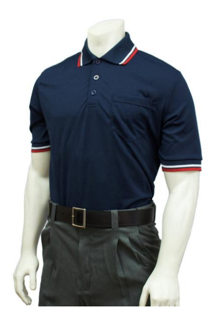
Navy Blue with red and white trim

Members should no longer wear these shirts