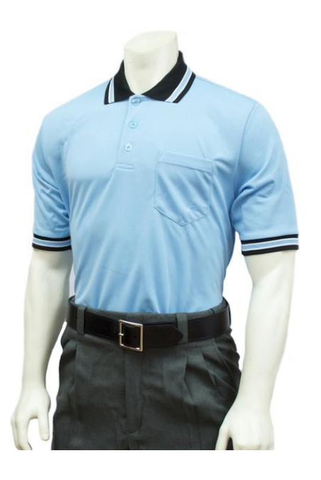
Powder Blue with black trim and collar