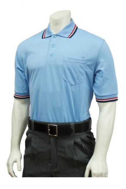
Powder Blue with red, white & blue trim